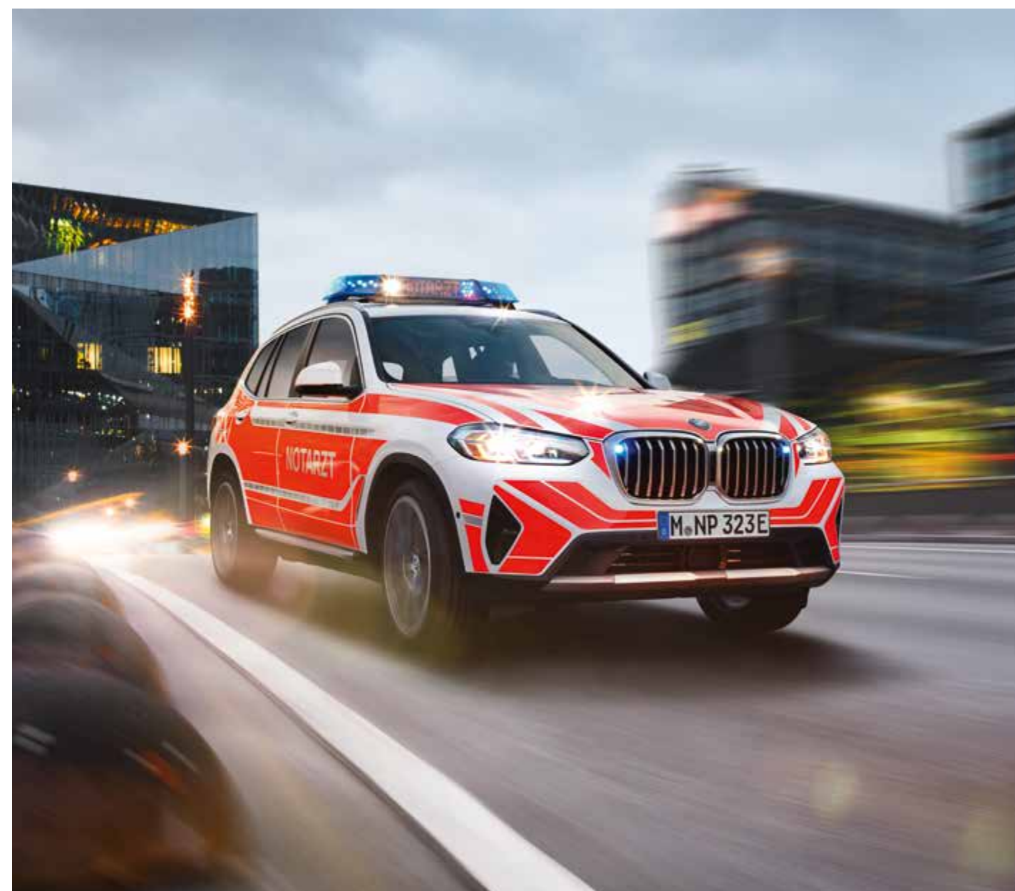
Image shows vehicle homologated and approved for the German market and may contain equipment features only available in this market. Please contact your BMW partner to find out which vehicles and equipment features are available to you.

thanks to the multi-award-winning BMW EfficientDynamics technology package and the available plug-in hybrids, it was possible to once again increase performance and at the same time significantly reduce consumption and emissions. The 8-speed Steptronic transmission is combined with an Auto Start/Stop function in the BMW X3. In this way, cost-effectiveness could be further improved without compromising the high level of responsiveness you would expect from a BMW.