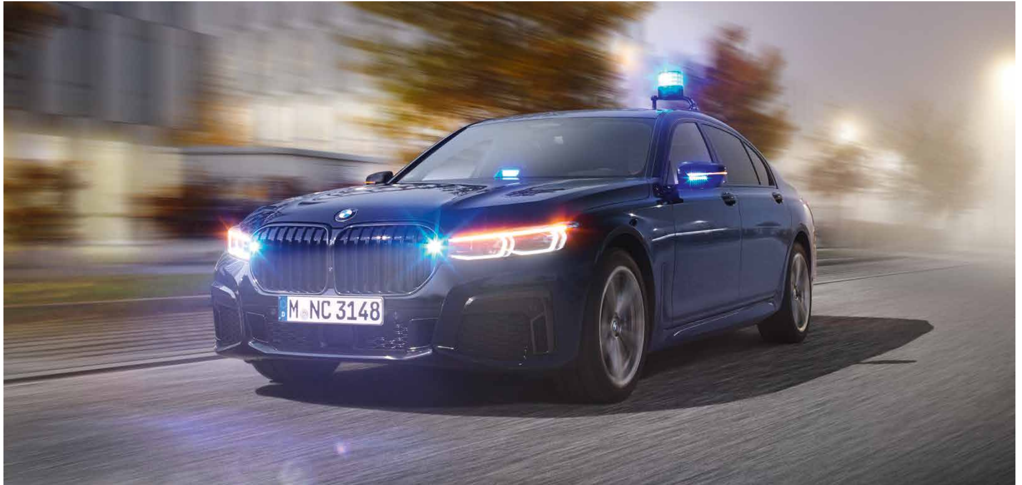
Image shows vehicle homologated and approved for the German market and may contain equipment features only available in this market. Please contact your BMW partner to find out which vehicles and equipment features are available to you.

Particularly in our top model, the BMW 7 Series, the innovative and sustainable plug-in hybrids 745e, 745Le and 745Le xDrive represent the best of both worlds.