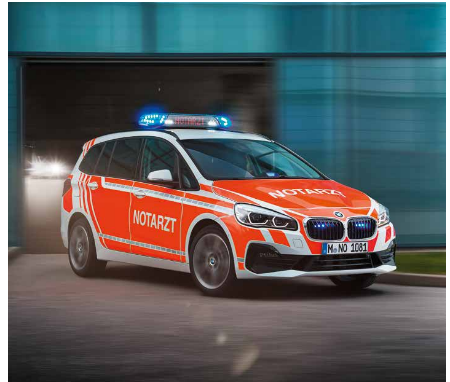
Image shows vehicle homologated and approved for the German market and may contain equipment features only available in this market. Please contact your BMW partner to find out which vehicles and equipment features are available to you.

Large doors and a high roof line facilitate easy entry into the BMW 2 Series Gran Tourer. In addition, the vehicle also offers maximum storage space with maximum flexibility. The luggage compartment of the BMW 2 Series Gran Tourer has a volume of up to 1905 litres and its floor can bear loads of up to 420 kg.