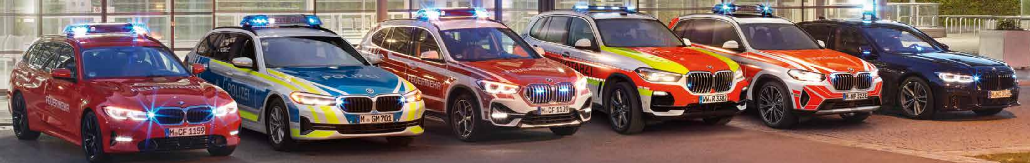
Image shows vehicle homologated and approved for the German market and may contain equipment features only available in this market. Please contact your BMW partner to find out which vehicles and equipment features are available to you.