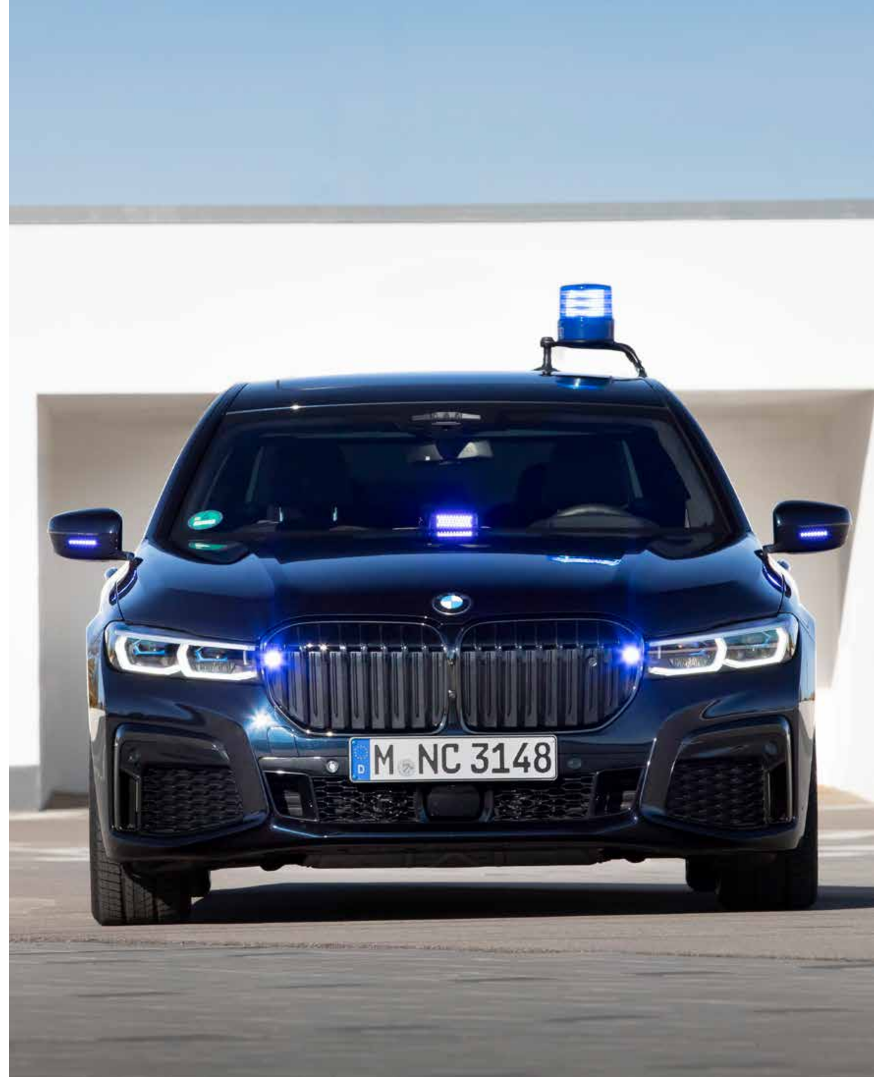
Image shows vehicle homologated and approved for the German market and may contain equipment features only available in this market. Please contact your BMW partner to find out which vehicles and equipment features are available to you.